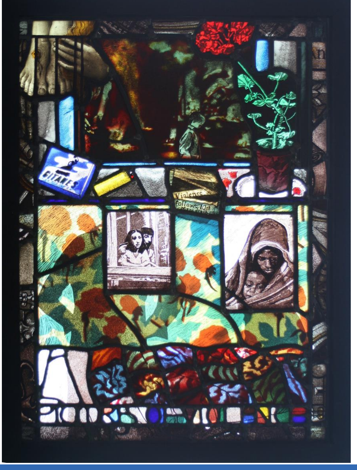
The Stained Glass Museum - Annual Review 2023